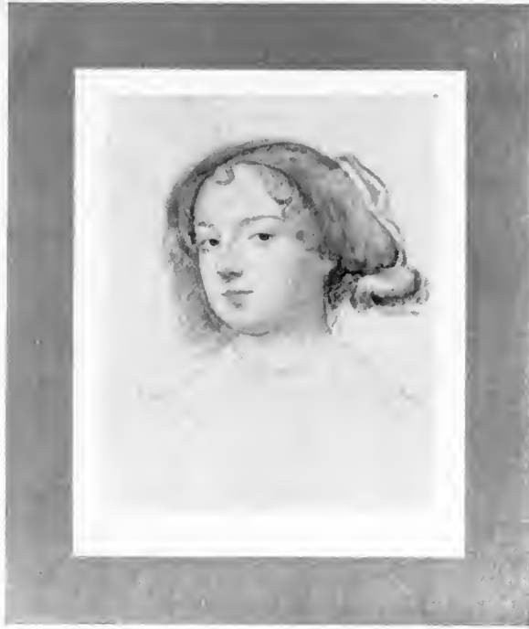
MISS CHRISTIAN TEMPLE BY OR AFTER SAMUEL COOPER

FROM THE COLLECTION OF THE RT. HON. SIR CHARLES DILKE, BART., M.P.